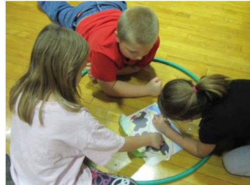
4-H After School Program

The primary goal of any 4-H program is to aid youth in developing skills they will need to be successful in the future. These include: communication, decision-making, cooperation, record keeping, responsibility, lifelong learning, respect, and countless others. 4-H initiatives are designed specifically to enhance the development of these skills through the motto of “learning by doing.” By engaging youth in various projects of their choosing they develop the ability to become independent contributing members of society.