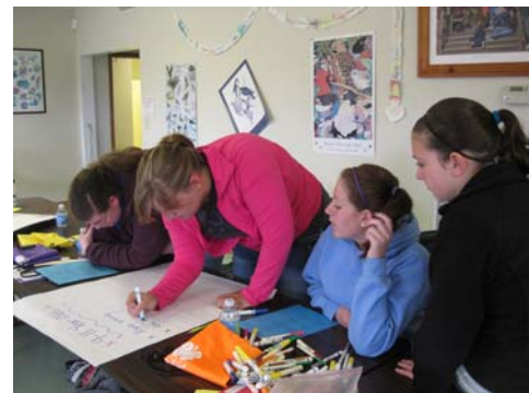
Camp Counselor Training

A successful youth program has the ability to enable its members to build on past successes, not simply repeat what previous generations have done, and Dodge County 4-H accomplishes this through training members in leadership development. In a typical 4-H year, approximately 150 youth serve as club officers. These students participate in training seminars and planning meetings to help lead their local clubs. Dodge County 4-H also has over 200 members serving as youth leaders, camp counselors, Friends Helping Friends facilitators, and in other capacities. These individuals are supported through numerous training endeavors that feature hands-on experience.